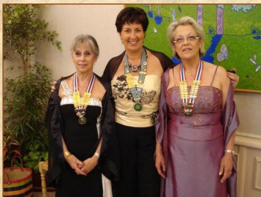
During the gala dinner the official installation of both national boards Agora and 41 Club 2010-2011

At 18.30h all Councillors were expected at the Town Hall for the banner exchange with all national and international delegations of 41 & Agora Club.