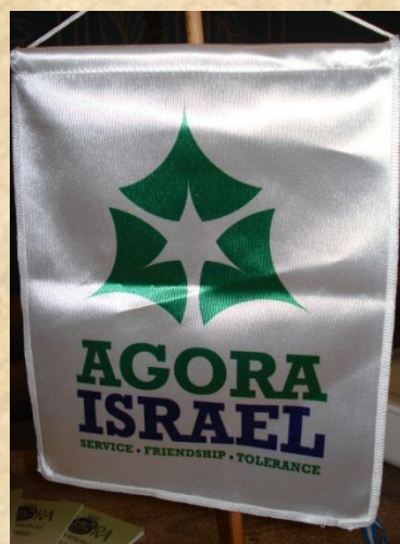
The group of 25 members of AC KRAYOT and the banner of AC ISRAEL.

The day after they organised a visit for me at Rosh Hankra, at the border with Libanon. It is only when you have been there and lived the situation that you realise how fragile this situation is. The ladies also gave me the opportunity to visit the grottoes in the neighbourhood by Cable car.